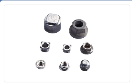
PRODUCT Applications A