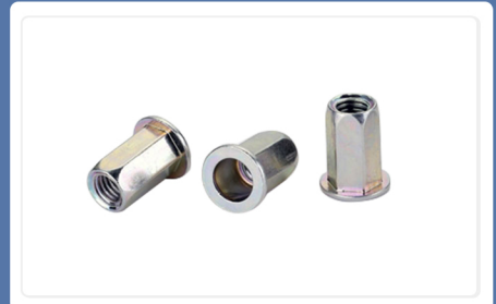
PRODUCT Applications B